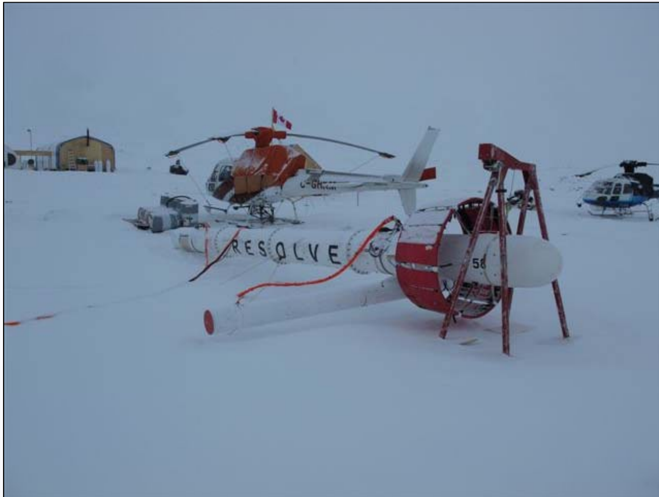
Helicopter and RESOLVE™ geophysical bird at Aurora camp