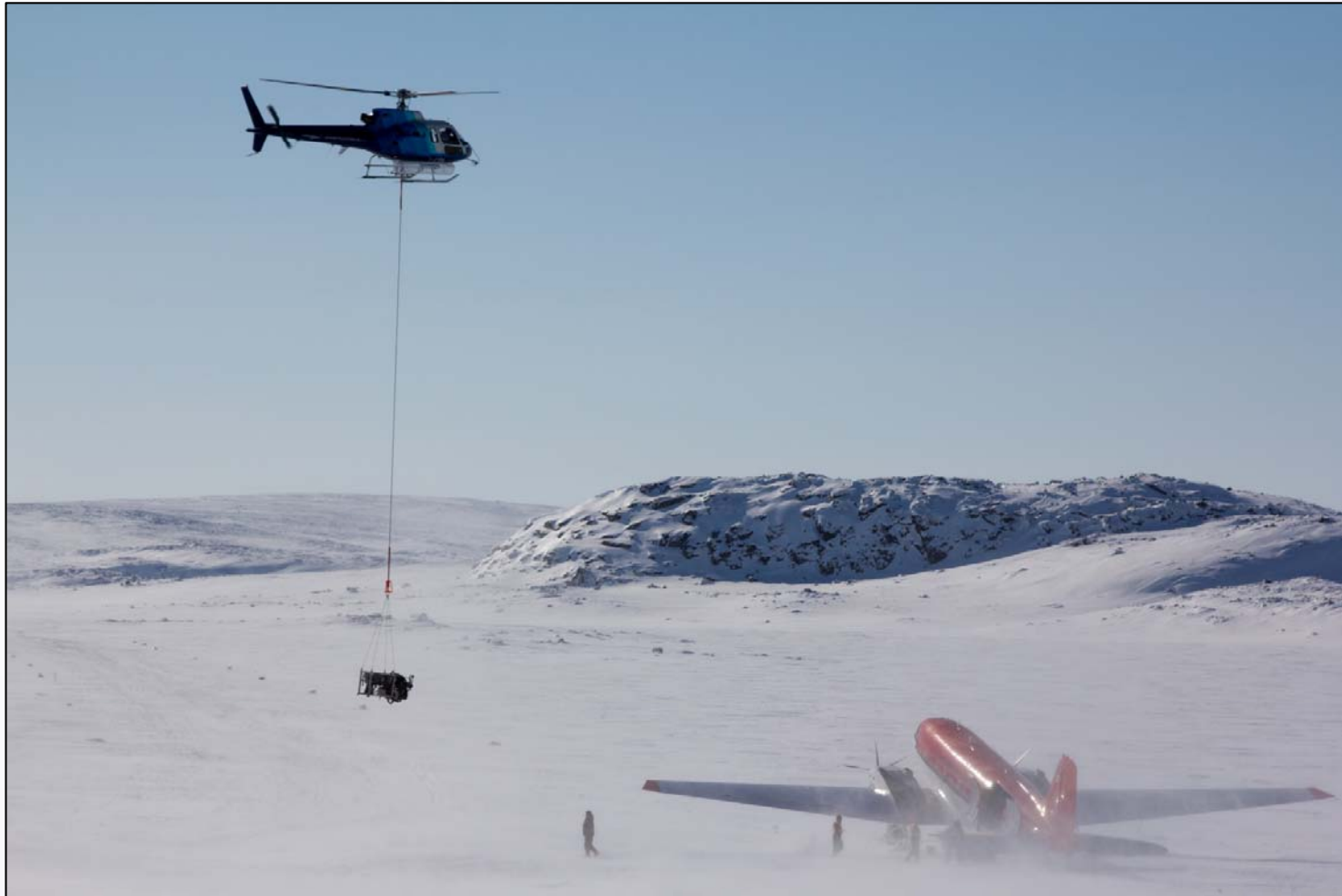
Helicopter slinging supplies at Aurora camp