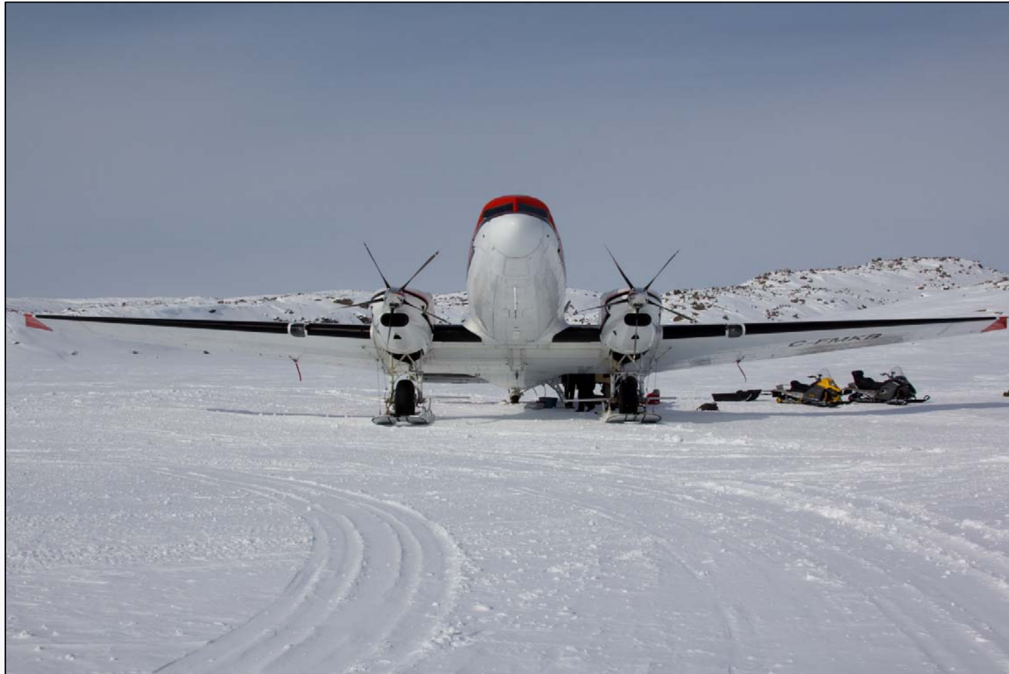
DC-3 aircraft unloading supplies at Aurora camp