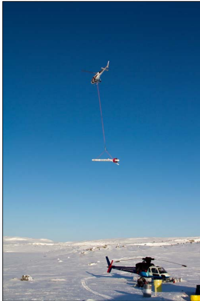
Conducting airborne geophysics