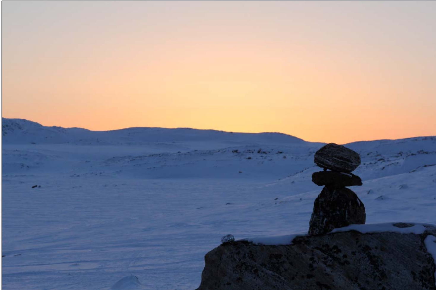
Sunset at Aurora camp