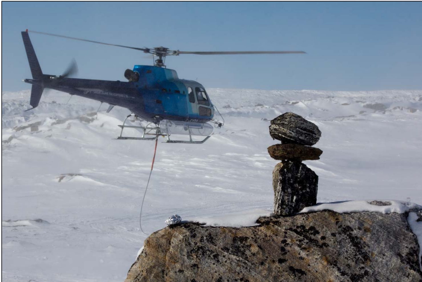
Helicopter at Aurora camp